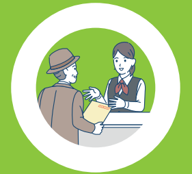
Government office or bank counter