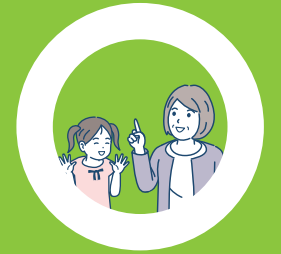
Conversations with family